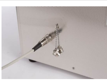
6-pole DIN connector