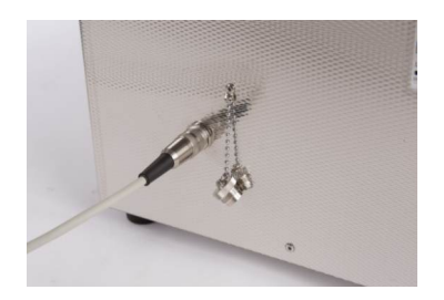
6-pole DIN connector