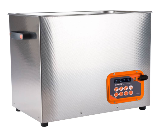
5200 EP S4 SC V2

* Stainless steel tank made in AISI 304 thickness 08/10 with round tank corners for a better removing of dirt residuals after cleaning process. The tank is conical and realized with a press machine