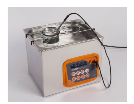
Example of external temperature sensor application