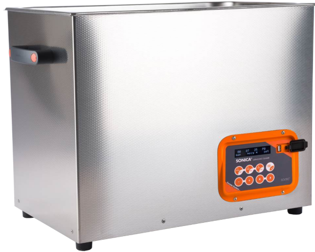
5200 EP S4 SC V2

* Stainless steel tank made in AISI 304 thickness 08/10 with round tank corners for a better removing of dirt residuals after cleaning process. The tank is conical and realized with a press machine