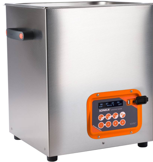
4300 EP S4 SC V2

* Stainless steel tank made in AISI 304 thickness 08/10 with round tank corners for a better removing of dirt residuals after cleaning process. The tank is conical and realized with a press machine