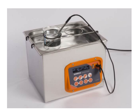
Example of external temperature sensor application