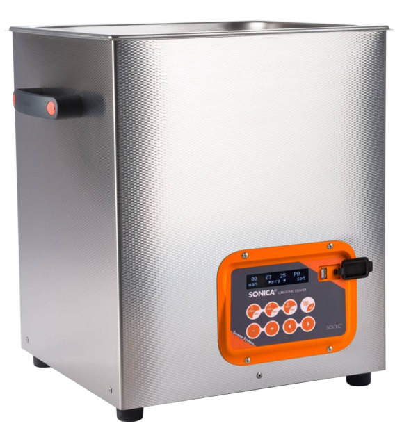
4200 EP S4 SC V2

* Stainless steel tank made in AISI 304 thickness 08/10 with round tank corners for a better removing of dirt residuals after cleaning process. The tank is conical and realized with a press machine