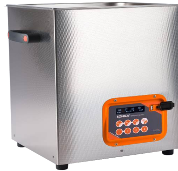
3300 EP S4 SC V2

* Stainless steel tank made in AISI 304 thickness 08/10 with round tank corners for a better removing of dirt residuals after cleaning process. The tank is conical and realized with a press machine