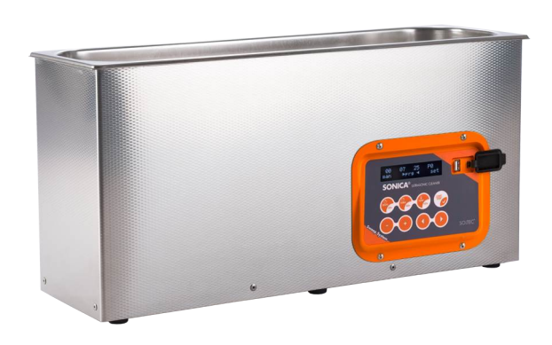
3200L EP S4 SC V2

* Stainless steel tank made in AISI 304 thickness 08/10 with round tank corners for a better removing of dirt residuals after cleaning process. The tank is conical and realized with a press machine