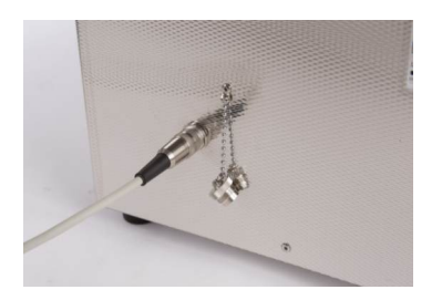
6-pole DIN connector