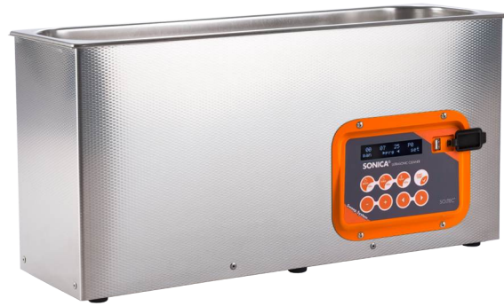
3200L EP S4 SC V2

* Stainless steel tank made in AISI 304 thickness 08/10 with round tank corners for a better removing of dirt residuals after cleaning process. The tank is conical and realized with a press machine