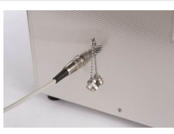
6-pole DIN connector