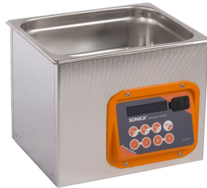
3200 EP S4 SC V2

* Stainless steel tank made in AISI 304 thickness 08/10 with round tank corners for a better removing of dirt residuals after cleaning process. The tank is conical and realized with a press machine