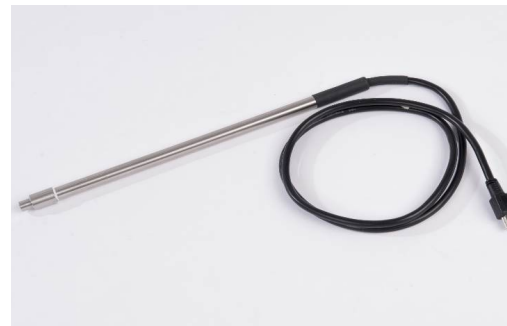
External temperature probe (optional) product code 091.002.0001