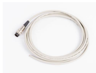
Multi-core cable with 6-pole (male) DIN connector (optional) product code 091.002.0002