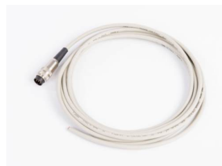
Multi-core cable with 6-pole (male) DIN connector (optional) product code 091.002.0002