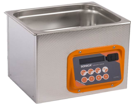
2400 EP S4 SC V2

* Stainless steel tank made in AISI 304 thickness 08/10 with round tank corners for a better removing of dirt residuals after cleaning process. The tank is conical and realized with a press machine