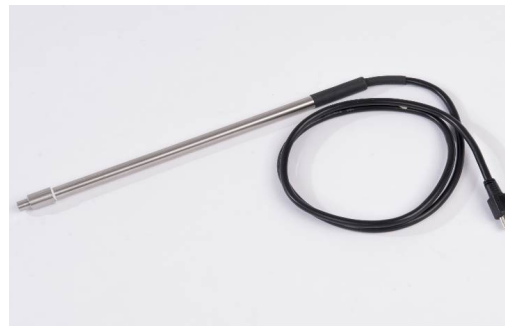
External temperature probe (optional) product code 091.002.0001