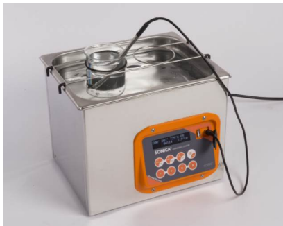
Example of external temperature sensor application