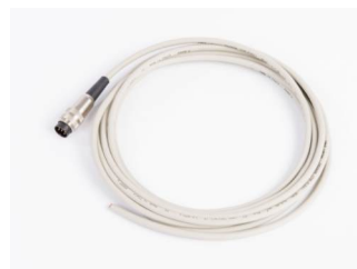
Multi-core cable with 6-pole (male) DIN connector (optional) product code 091.002.0002