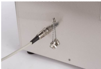
6-pole DIN connector