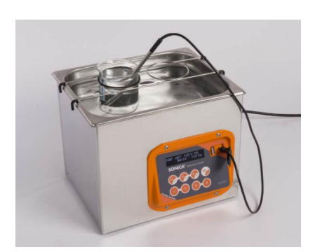
Example of external temperature sensor application