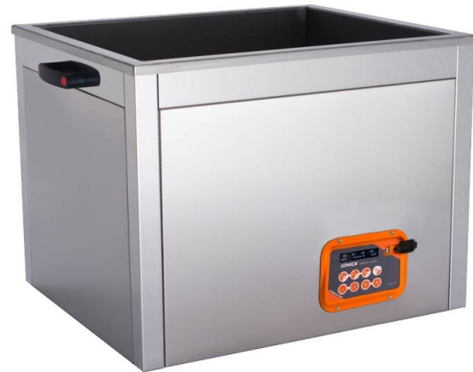
90 EP S4 SC V2

* Special stainless steel tank made in AISI 316Ti thickness 20/10 with round tank corners for a better removing of dirt residuals after cleaning process. The tank is welded with TIG process