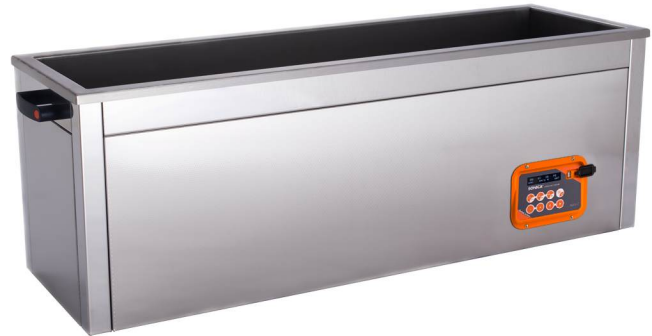
60 EP S4 SC V2

* Special stainless steel tank made in AISI 316Ti thickness 20/10 with round tank corners for a better removing of dirt residuals after cleaning process. The tank is welded with TIG process