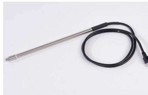
External temperature probe (optional) product code 091.002.0001