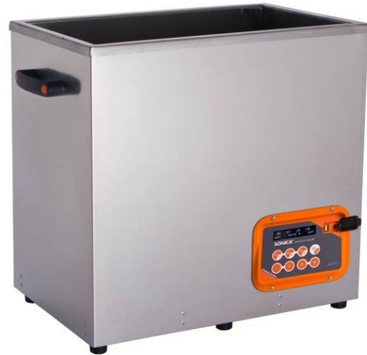
45 EP S4 SC V2