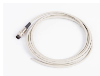
Multi-core cable with 6-pole (male) DIN connector (optional) product code 091.002.0002