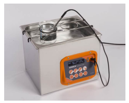
Example of external temperature sensor application