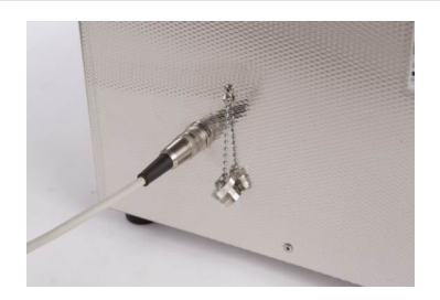
6-pole DIN connector