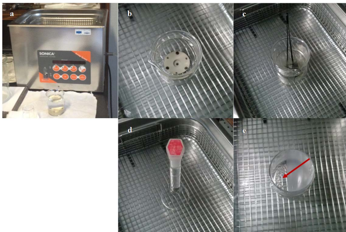
Figure 2: Cleaning in Ultrasound Bath SONICA 3200 EP: a) Ultrasound Bath SONICA 3200 EP, b) STM electrochemical cell, c) tweezers, d) glassware, e) glue used for coating of the tips.